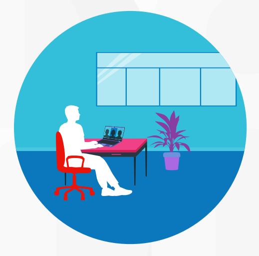
Employees who work on-site.